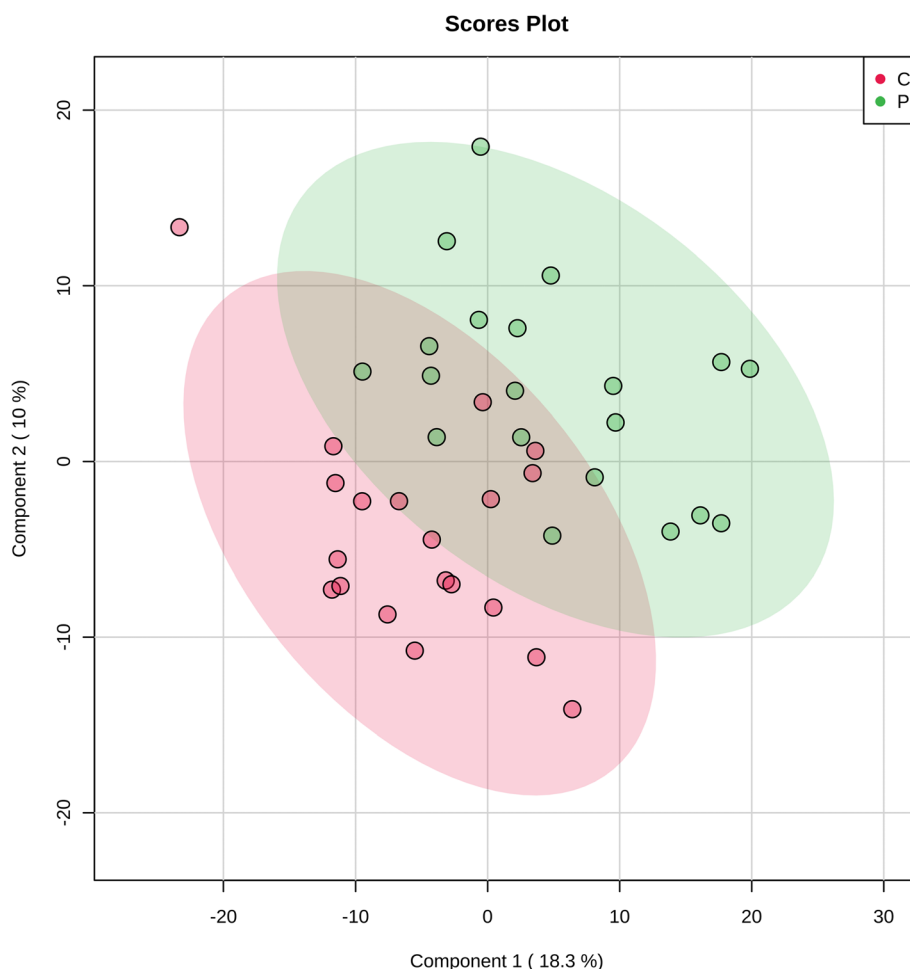
Fig. 1 PLS-DA score plot of skin surface lipid (SSL) from senile pruritus patients and healthy person controls. SSL profiles of senile pruritus (green dots) and controls (red dots) are obviously separated. R^2 = 0.9469 , Q^2 = 0.12092

A total of 796 SSLs were detected by LC-MS/MS, and classified into 25 categories. The two groups were subsequently compared for their lipid species. Based on the PLS-DA analysis and Q-value (false discovery rate) evaluation, several parameters were used to identify lipid species with significant differences between the senile pruritus patients and control subjects. These parameters included variable importance for projection > 1 , fold change > 1.2 or < 0.83 , and Q-value < 0.05 . Based on these criteria, a heat map and volcano plot were created (Fig. 2a,b). A total of 81 lipids with significant changes were identified based on their differences between the two groups (Supplementary Table 2). These 81 SSLs belonged to 17 categories according to their biochemical features. The relative amount of each lipid class was